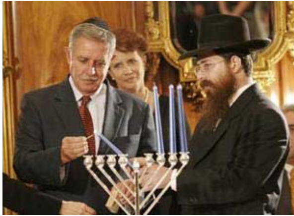
Guatemala - President Alfonso Portillo

• Palestinians in the Palestinian Territories of the Gaza Strip & the West Bank must pay taxes to Israel yet they do not have the right to vote in Israeli elections. This